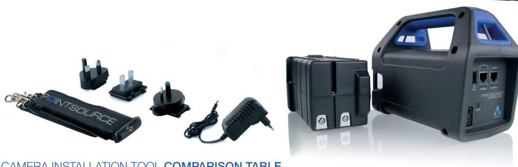
IP CAMERA INSTALLATION TOOL COMPARISON TABLE

Extra battery modules are available as an option.